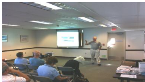
See CalPilots Continued on page 3)

which oversees secondary education schools to insure that students do not lose their tuition to unscrupulous practices.