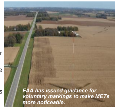
FAA has issued guidance for voluntary markings to make METs more noticeable.

pilotsafetybrochures/ highlighting several safety tips. One preflight task that can help you stay safe is to see if your state maintains a tower registry on the Internet. Then check your route of flight for any possible overlap. You are also strongly encouraged to conduct an overflight of a work area from a safe altitude to check for obstructions before descending to altitudes where these towers may be present.